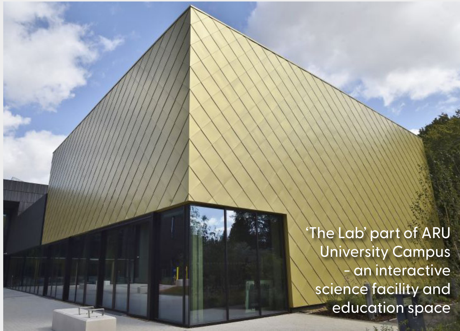
'The Lab' part of ARU University Campus - an interactive science facility and education space