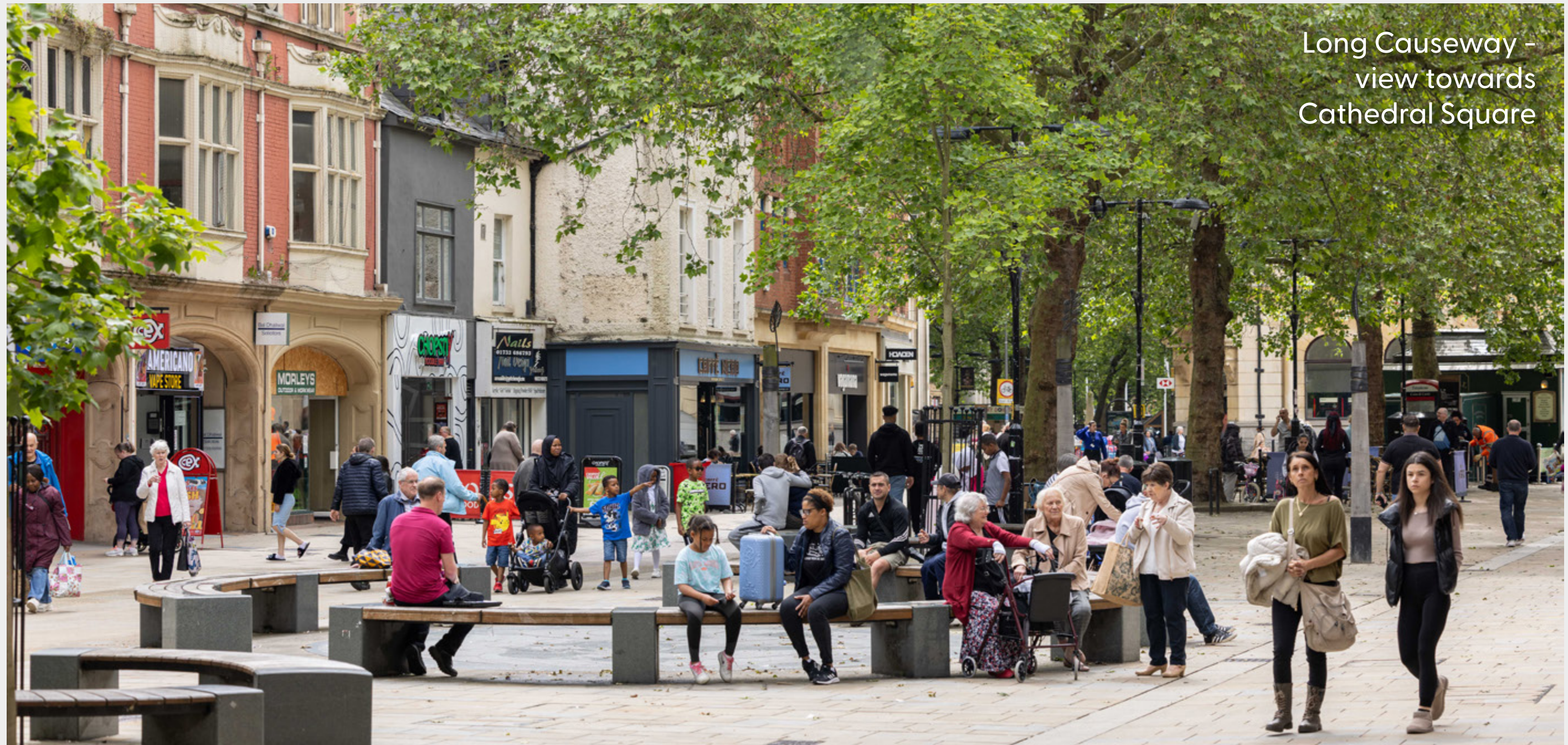
Long Causeway - view towards Cathedral Square