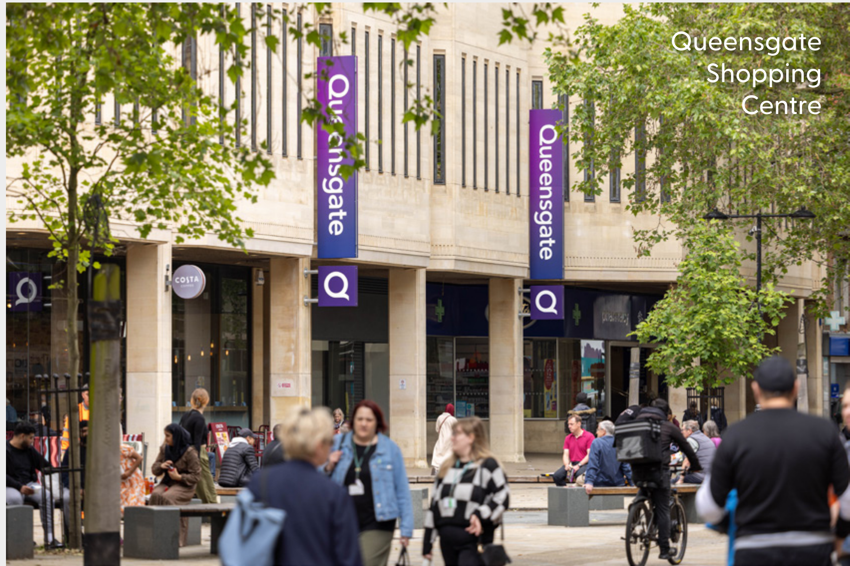
Queensgate Shopping Centre