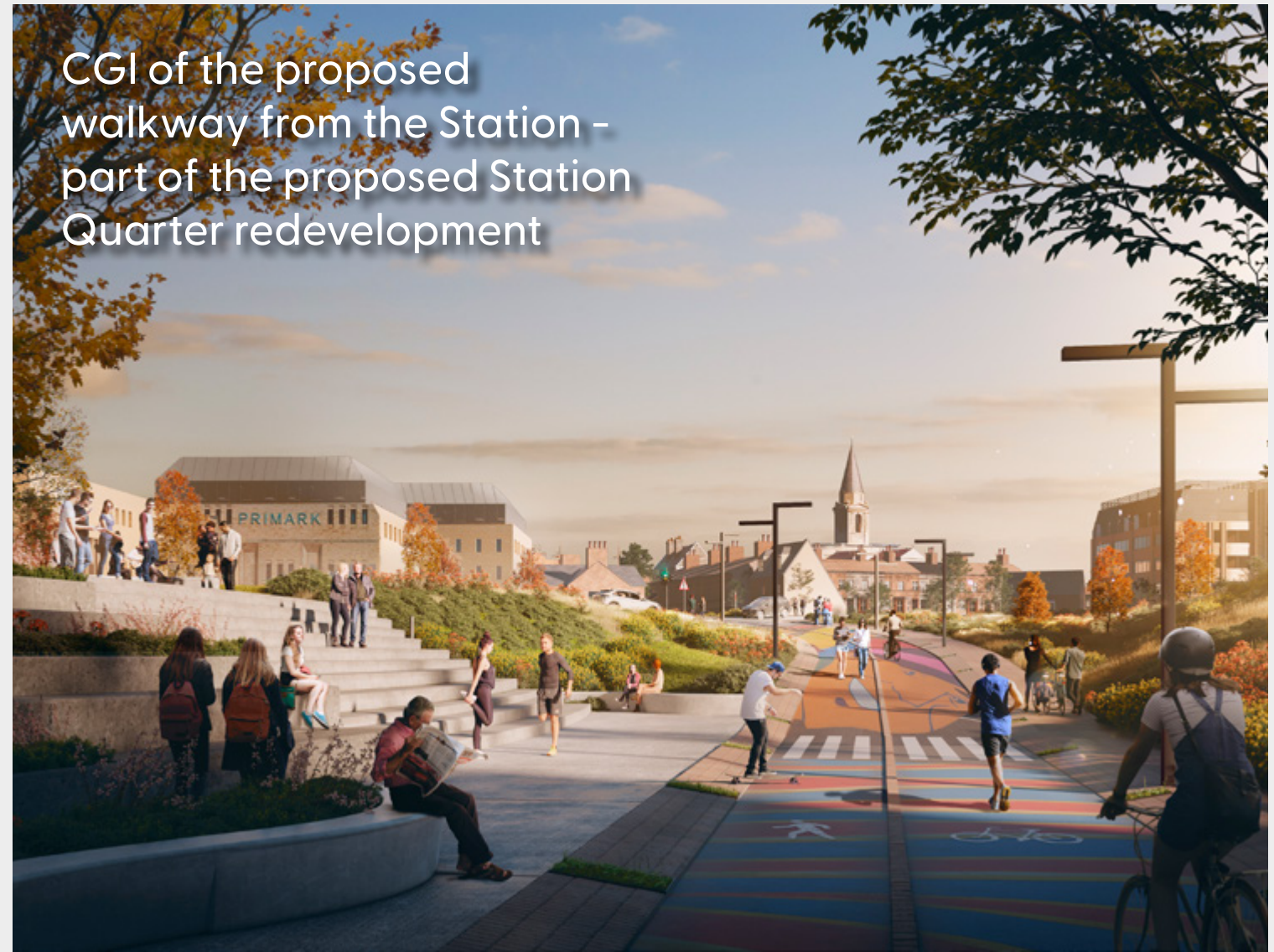
CGI of the proposed walkway from the Station - part of the proposed Station Quarter redevelopment