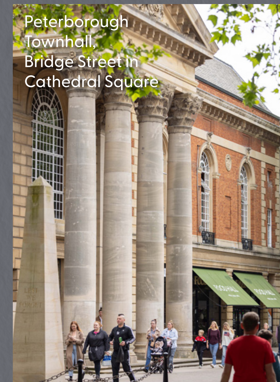
Peterborough Townhall, Bridge Street in Cathedral Square