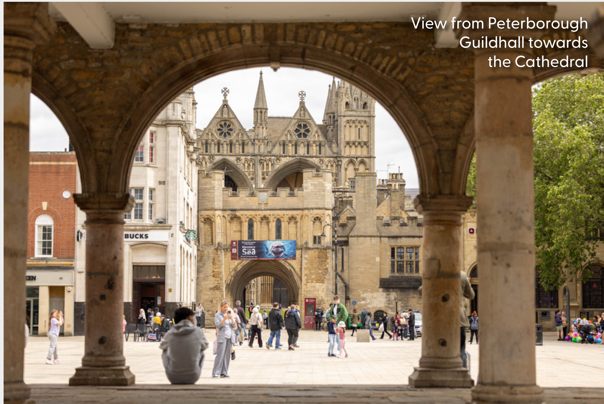
View from Peterborough Guildhall towards the Cathedral