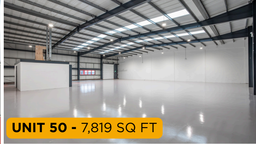
UNIT 50 - 7,819 SQ FT