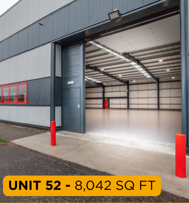
UNIT 52 - 8,042 SQ FT