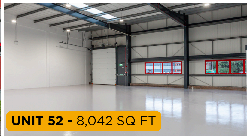
UNIT 52 - 8,042 SQ FT