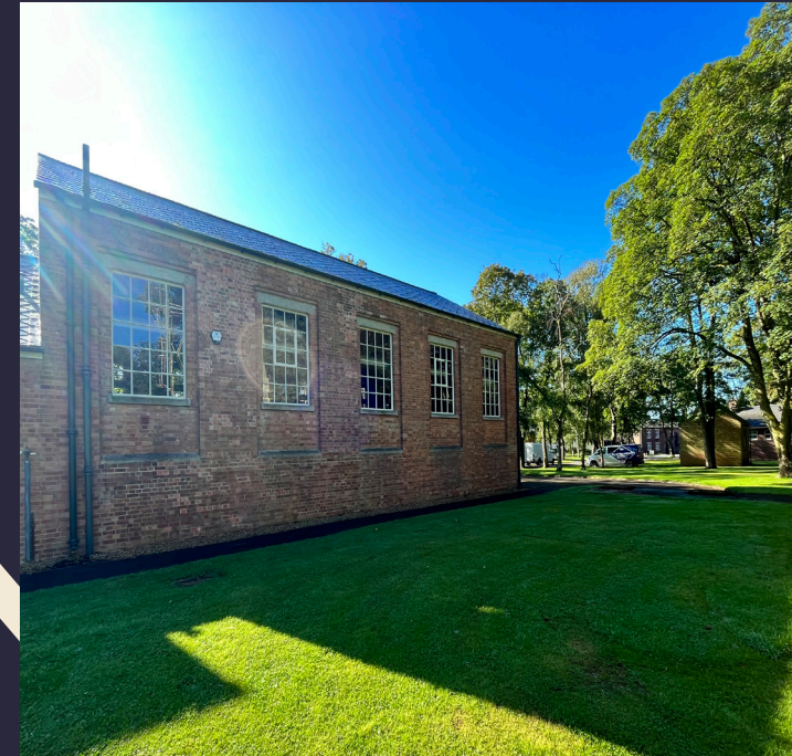
The Power House retains its original Air Ministry beam crane.