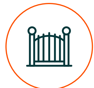
Secure gated entrance