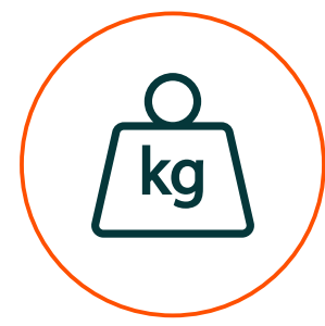
50 kN sq/m floor loading