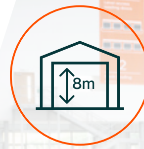
8m eaves height