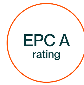
EPC A rating