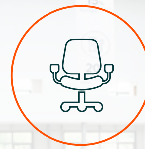
WCs and kitchenettes

*All areas are approximate gross external areas.