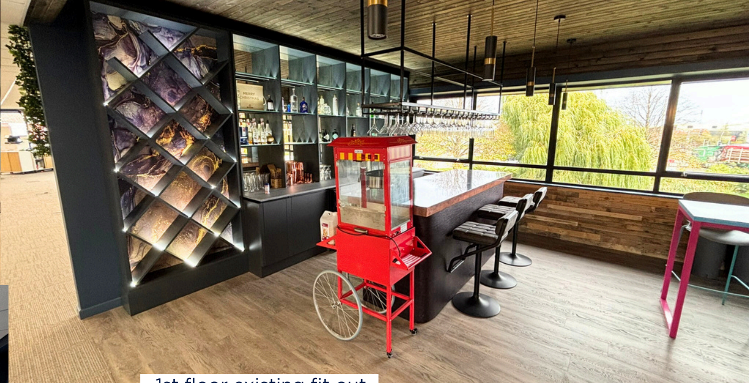
1st floor existing fit out.