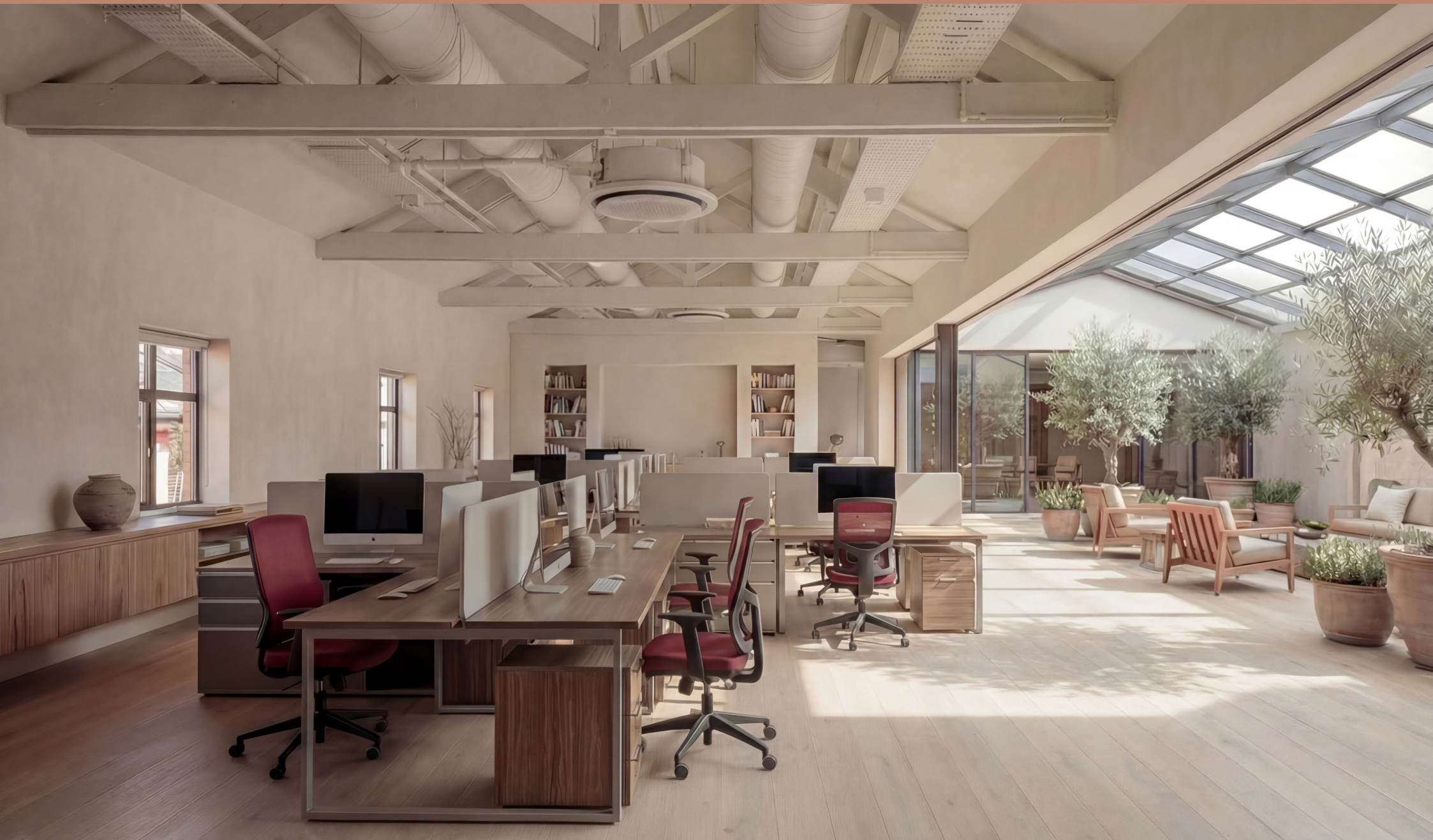
FIRST FLOOR OFFICE - CGI Wethered House | Marlow | SL7 2AF