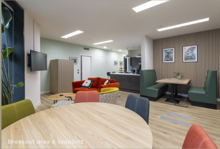
Breakout area & teapoint