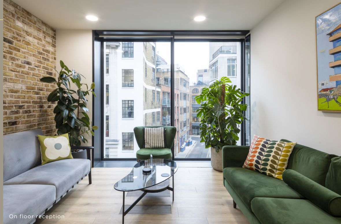
On floor reception