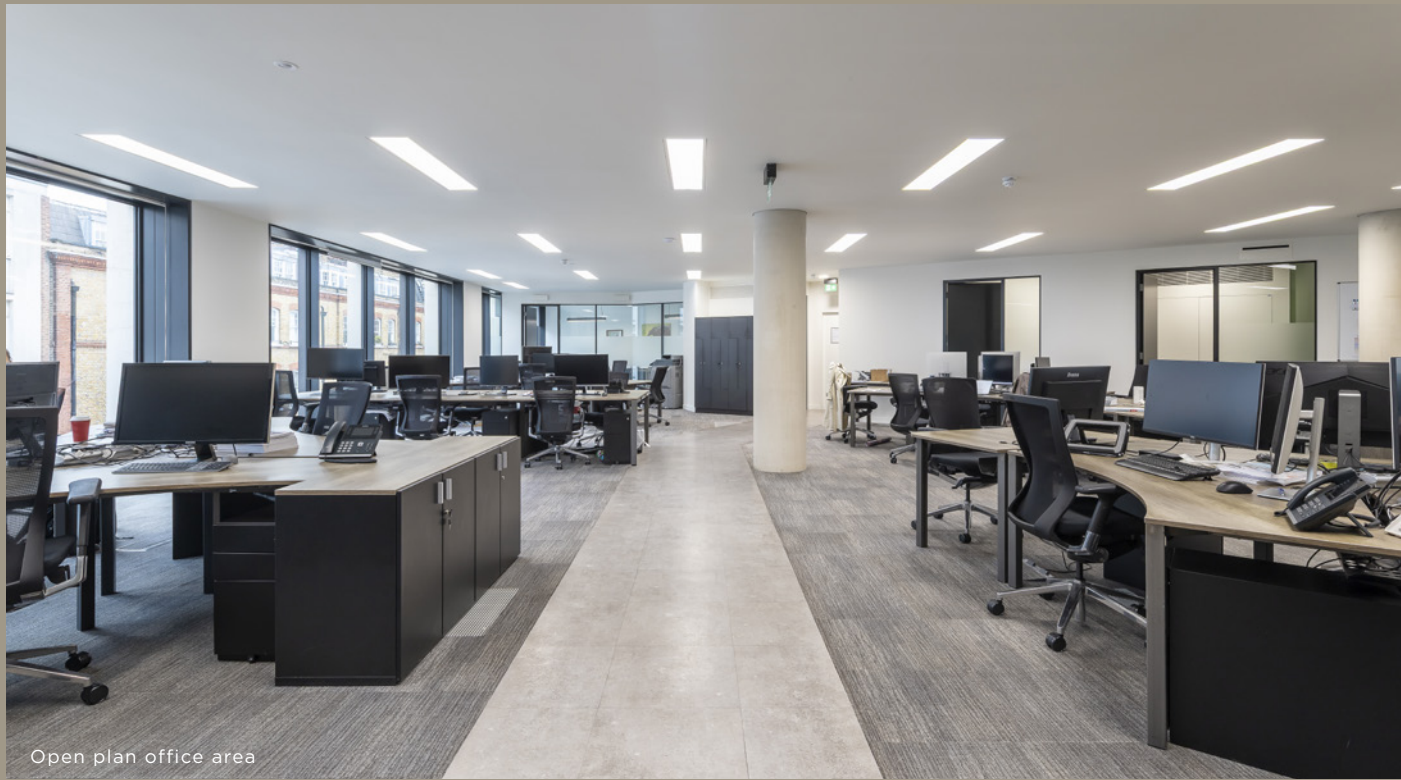
Open plan office area