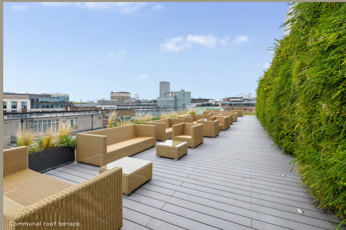
Communal roof terrace