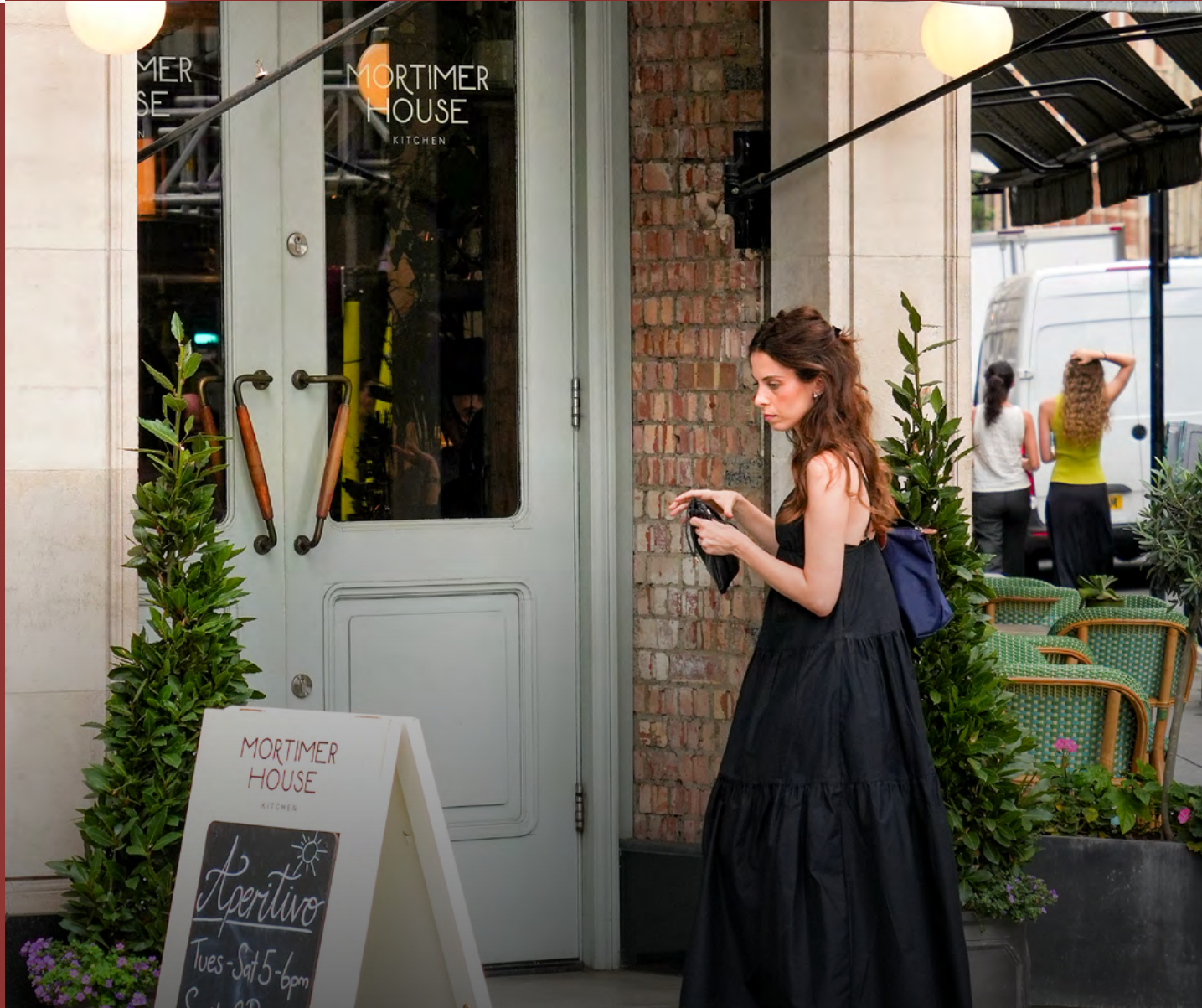
RIGHT The Oxford Market