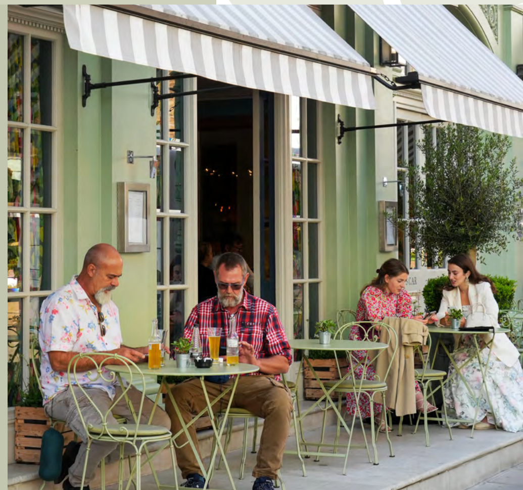
RIGHT Charlotte Street Hotel