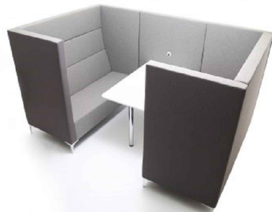
CARA POD HIGHLINE 2 SEATER