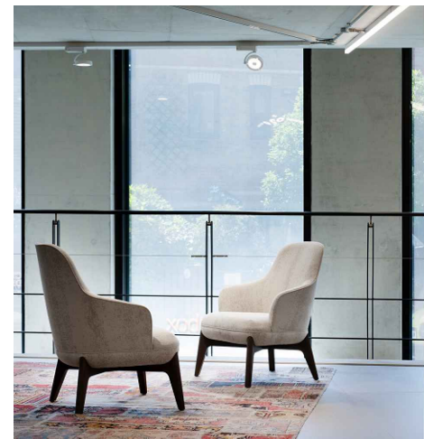
ORANGEBOX COZE LOUNGE CHAIR