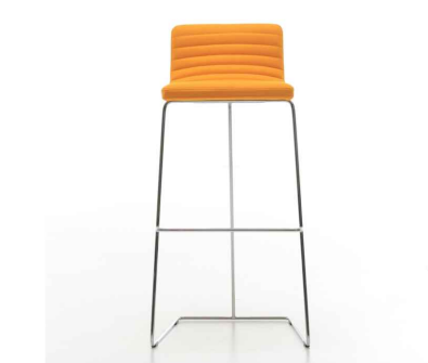
TECHNO INFO BAR STOOL