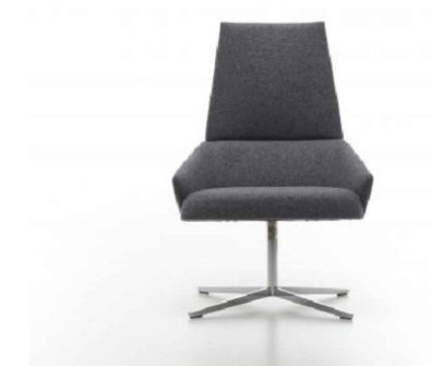
WALL STREET SEATS