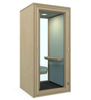
SPACESTOR RESIDENCE WORK POD