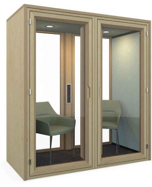
SPACESTOR RESIDENCE MEET POD