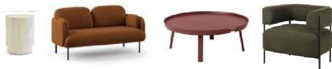
Soft seating area

Box planter on top of existing storage units decorative tops to be removed PLANTS NOT INCLUDED