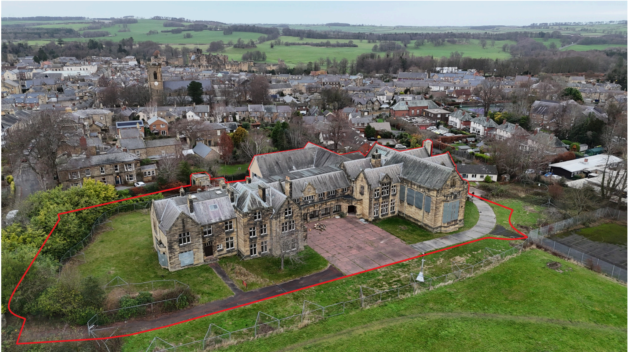
The Duke's Middle School The Avenue, Alnwick, Northumberland, NE66 1AJ