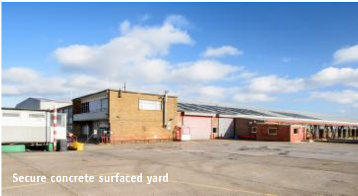
Secure concrete surfaced yard

Alternatively our client will consider selling its outright ownership in the property and offers are invited.