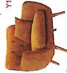
THOREN Armchair and 3 seater sofa, or similar