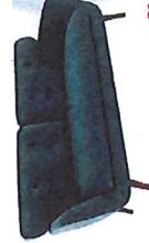
ALTA 3 and 2 Seater Sofa, Armchair, or similar