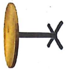
SOLID OAK Table, or similar