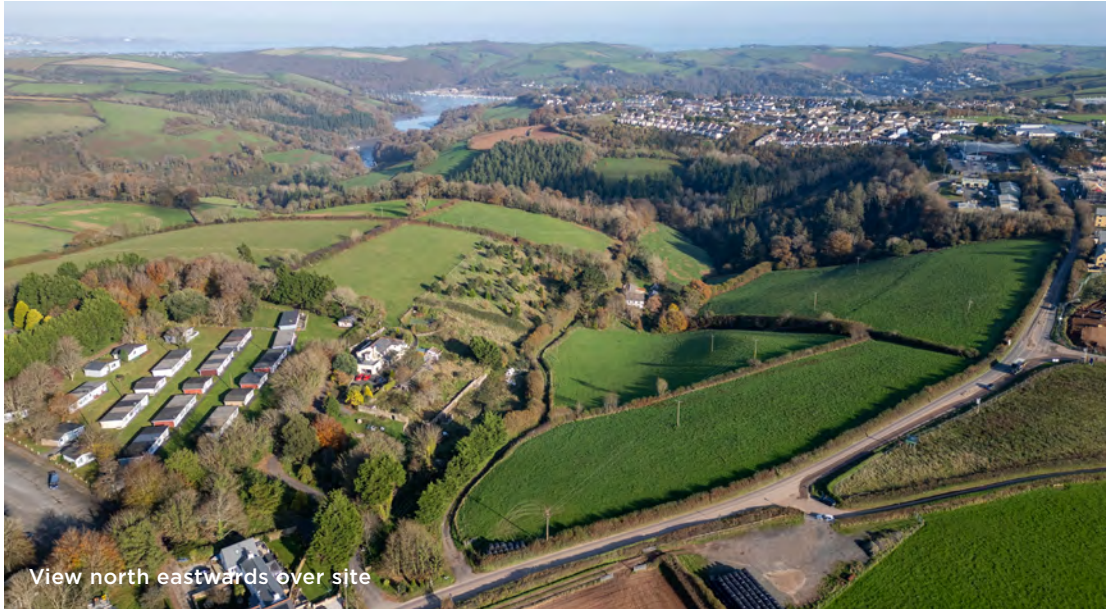
View north eastwards over site